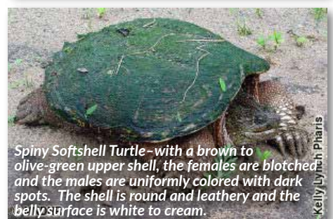
Spiny Softshell Turtle —with a brown to olive-green upper shell, the females are blotched and the males are uniformly colored with dark spots. The shell is round and leathery and the belly surface is white to cream.