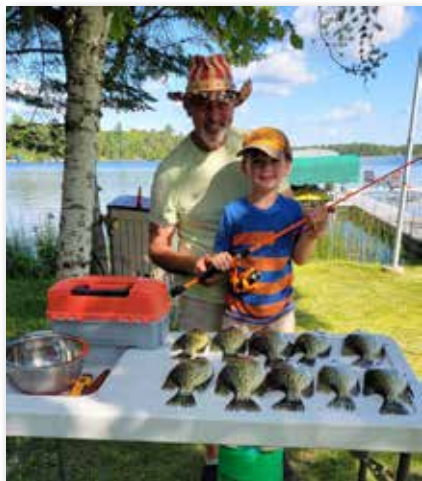
"My Grandson's success!!"

One Stop in Longville donated money, with a matching amount from the Blackwater Lake Association Board of Directors.