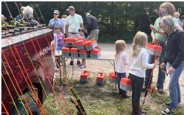
Anticipating the fishing tackle give-away.