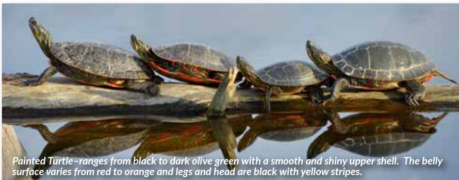
Painted Turtle —ranges from black to dark olive green with a smooth and shiny upper shell. The belly surface varies from red to orange and legs and head are black with yellow stripes.