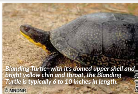
Blanding Turtle —with its domed upper shell and bright yellow chin and throat, the Blanding Turtle is typically 6 to 10 inches in length.