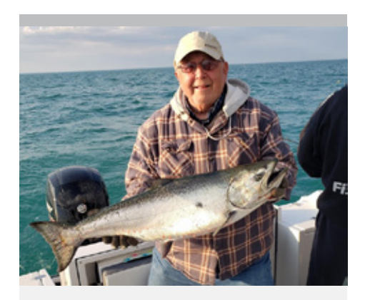
Working together, we can make things happen!

It takes a village to help keep this lake the gem that it is. Did you know that we are in 27th year as an Association? We continue to do well thanks to us all.